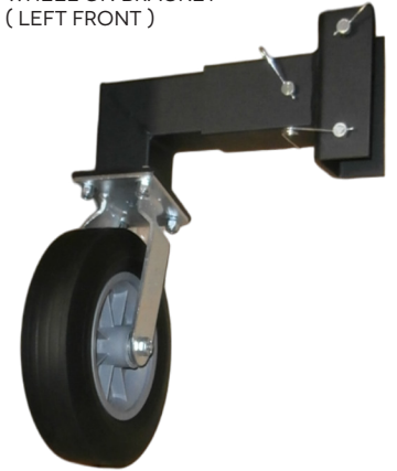
EXAMPLE OF NON-SWIVEL WHEEL ON BRACKET (LEFT FRONT)

Use four bolts, four washers, and four lock nuts for each wheel bracket. Attach a swivel wheel to a left bracket AND a right bracket. Then attach a non-swivel wheel to the other left bracket AND the other right bracket.