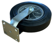
(2) NON-SWIVEL WHEELS