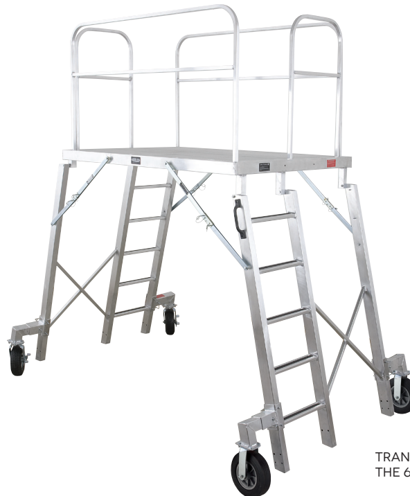
TRANSPORT PACKAGE SHOWN ON THE 6' COMMAND CENTER PODIUM