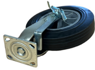
(2) SWIVEL WHEELS